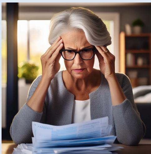
Adobe AI illustration

Genetic-testing scams have re-emerged as a significant threat to seniors, with fraudsters exploiting their trust to steal personal information and defraud Medicare.